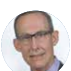
King, Graham Canada