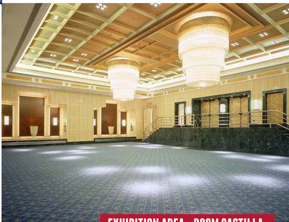
EXHIBITION AREA - ROOM CASTILLA