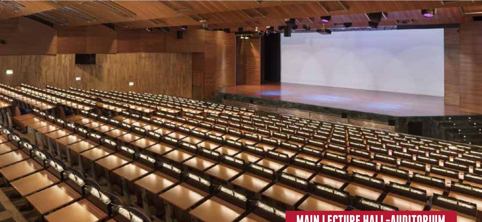
MAIN LECTURE HALL-AUDITORIUM